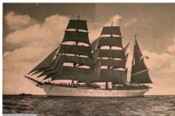
Horst Wessel under sail